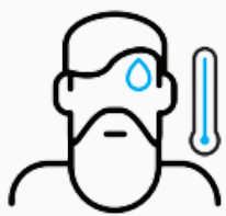
Fever and/or chills

Do you have any of the following four (4) symptoms not related to known allergies or other chronic conditions?