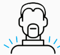
Muscle aches/joint pain