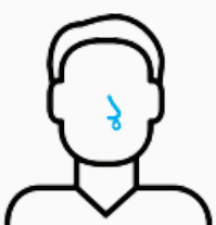
Runny nose/ nasal congestion

TWO or more of the following new or worsening symptoms?