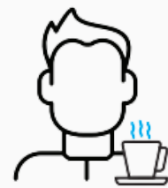
Decrease or loss of taste or smell